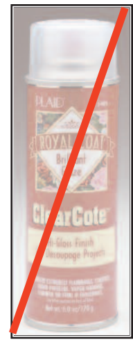
1461 Royal Coat Clear Cote Glaze DISCONTINUED