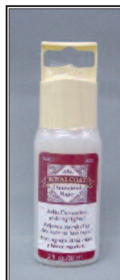
2051 $4.10 - 2 oz. Use to add dimension & highlights. Clear & non-yellowing.