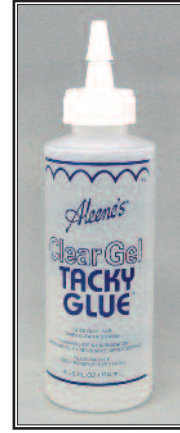
418 Aleene's Clear Tacky Glue $3.50 4 oz. Works well with heavy braid and fabrics.