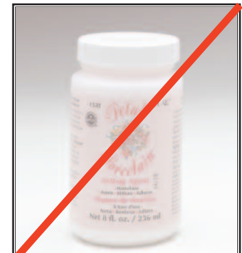
1541 Petal Porcelain DISCONTINUED