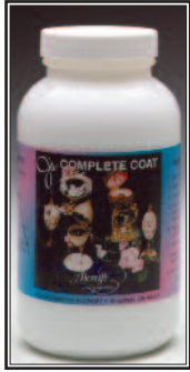
1296 - $7.95 8 oz. bottle 1297 - $11.95 16 oz. bottle J's Complete Coat

Use to make decals from paper prints and building up layers for decoupage. Strengthens eggshells and is easily sanded.