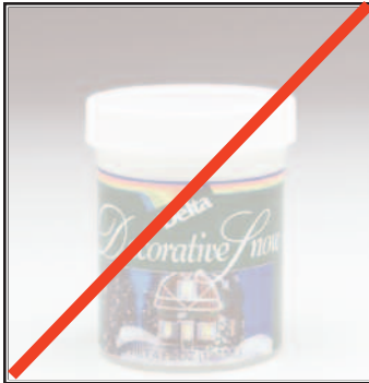
821 Delta's Decorative Snow DISCONTINUED