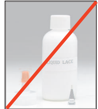
528 Liquid Lace 527-T with tip DISCONTINUED