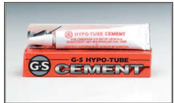
649 GS Hypo Jewelry Cement $5.00 1/3 oz. Precision applicator tip for fine detail work. Use for flatback jewels, beads, jewelry and more.