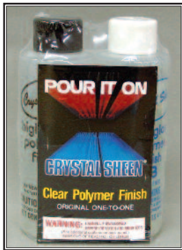
828 $19.25 8 oz. kit Pour It On Crystal Sheen 2 part high gloss clear polymer finish.

Provides a high gloss finish. Idea: Decoupage egg with Royal Coat or J's Coat, then dip or pour 2 coats gloss over egg to achieve a lovely finish.