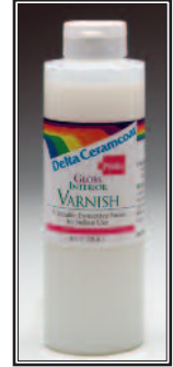
817 $7.50 8 oz. bottle Delta Ceramcoat Matte Varnish

Water base sealer, glue and finish all in one. Provides quick buildup. Sprinkle with a touch of Polyflakes or Glass Flakes for delicate highlights.