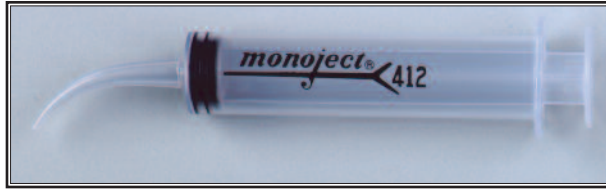
M-412 Monoject - Glue Applicator $1.20

Fill these bottles with your favorite glues for an easier & more precise application.