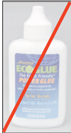
1298 Earth Friendly Power DISCONTINUED