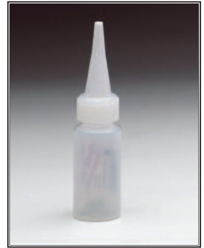
NT-700 Needle Tip Applicator $2.00

Holds and dispenses white glue, paint, etc. in a fine line.