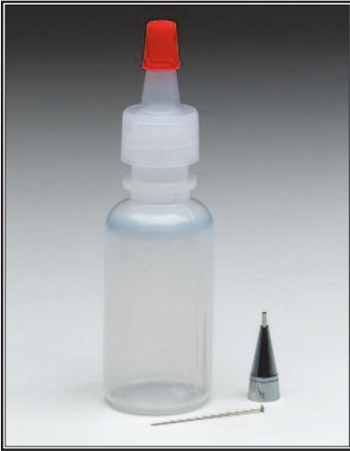
GA-15 Glue Applicator $3.95

Holds 1/2 oz. Great for applying glue in a fine line for tiny cords. Includes metal tip and pin.