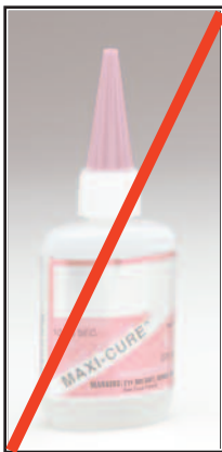
BS-112 Maxi-Cure DISCONTINUED