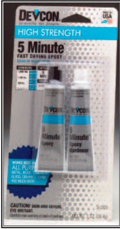
S-205 Devcon's 5 Minute Epoxy $5.00

1 oz. net wt. tubes. Same uses as S-209, but smaller sized.