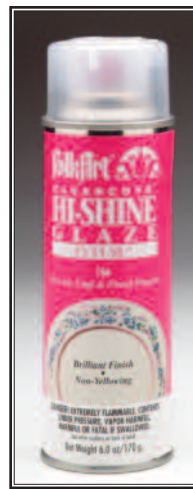
785 $9.65 11 oz. ClearCote Hi-Shine Glaze Aerosol - Brilliant, deep gloss, lacquer-like finish. Concentrated for instant super thick build up.