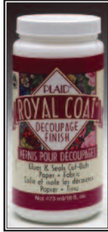
1401 - $7.95 8 oz. jar 1402 - $13.95 16 oz. jar Royal Coat Decoupage Finish

Use to make decals from paper prints and building up layers for decoupage. Strengthens eggshells and is easily sanded.