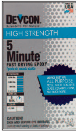
S-209 Devcon's 5 Minute Epoxy $19.60

1 oz. net wt. tubes. Same uses as S-209, but smaller sized.