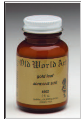
802 Gold Leaf Adhesive $5.80

2 oz. jar - Not only used for gold leafing! Best adhesive for glitter and polyflakes. Slow drying provides more working time.