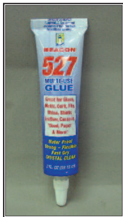
527-R $5.40 2 oz. Identical properties to the discontinued Bond 527. Sorry no precision tip available.