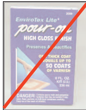
829 Pour-On EnviroTex DISCONTINUED