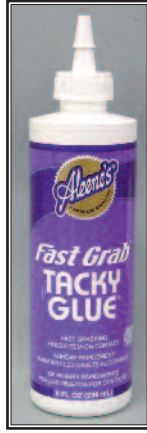
410 Aleene's Fast Grab Tacky Glue $3.95 4 oz. Same as the original, but grabs items faster.