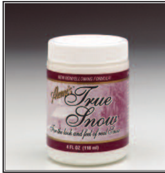
SP-407 Aleene's True Snow $5.85 4 oz. jar - Creates the look and feel of light and fluffy snow. Add polyflakes for a nice sparkle.