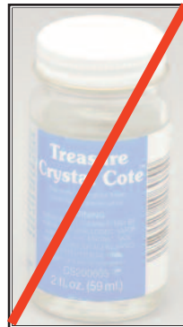
826 Treasure Crystal Coat DISCONTINUED