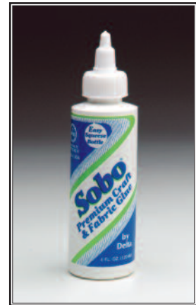
403 Sobo Glue $3.50 4 oz. All purpose, fast setting white glue. Good for beading. Dries clear, non-yellowing.