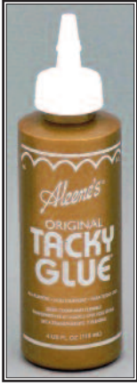
408 Aleene's Original Tacky Glue $3.75 4 oz. All purpose white glue. Non-yellowing.