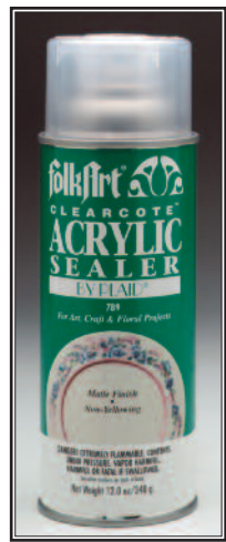
789 $9.65 12 oz. FolkArt Matte Acrylic Sealer Aerosol - A soft subtle, velvety smooth, matte finish. Use as a final finish for decoupage products.