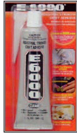
1303 - 2 oz E6000 with tip $4.25 (shown)

9 oz. net wt. bottles. Use to glue findings, hinges and eggs to stands. Dries clear and fast.