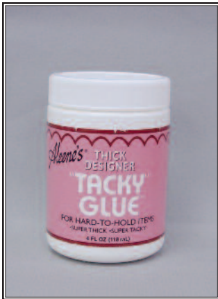
10-1 Aleene's Thick Designer Tacky Glue $4.95 4 oz. Jar. Super thick for gluing hard to hold objects. Dries Clear.