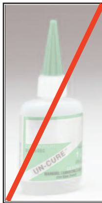
BS-161 Uncure DISCONTINUED