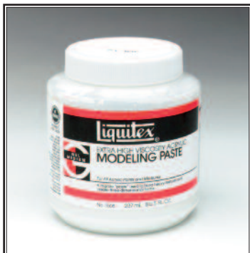
5508 $18.65 - 8 oz. Liquitex Modeling Paste A marble paste used to texture and create 3 dimensional forms and lines.