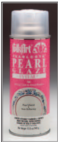
783 $9.65 11.5 oz. FolkArt Pearl Glaze Aerosol - Provides a translucent non-yellowing pearlized finish.