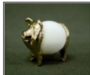
Pig M515 DISCONTINUED