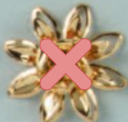
*9425 DISCONTINUED SUB 9221