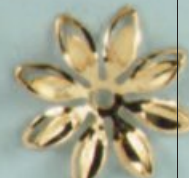
*9221 $.85 *9221SV $.85

Use 9220, a Jewel Bead and a Pin to Make a Top