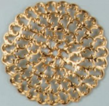
•8016 $3.10 Inverted Dap