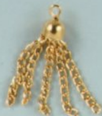
NT-6 DISC NT-6SV DISC