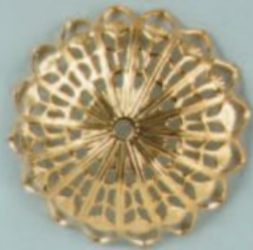
9134 $2.65 1/4" Dap