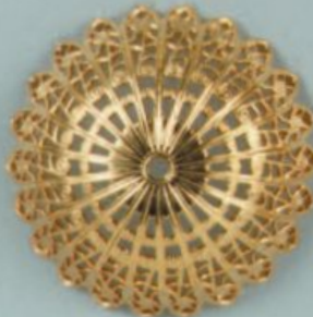
7038 $3.85 1/2" Dap