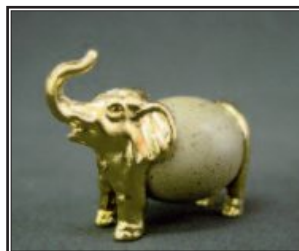
Elephant M448 $7.95 Button Quail Size