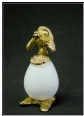
Dog M 451 $7.95 Quail Size