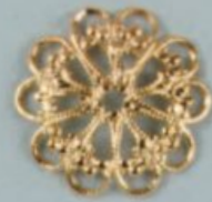
**9114 $1.55 **9114SV $1.55