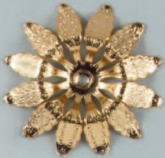
•*7057 $2.85 Inverted Dap