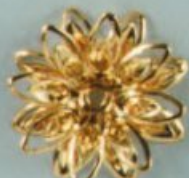
*9535 $2.60 *9535SV $2.60