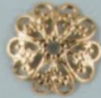
**752 $1.25 **752SV $1.25