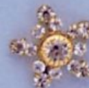
1087 $2.75 Crystal Only